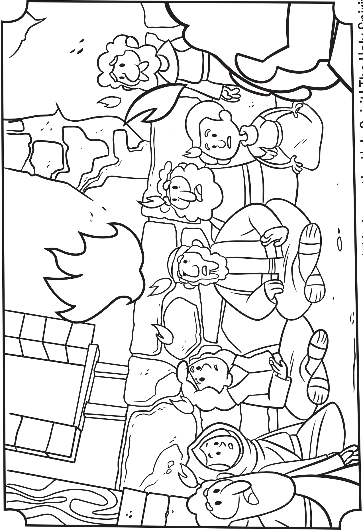
Jesus had promised his followers a special helper - the Holy Spirit! The Holy Spirit came at Pentecost. Acts 2:1--4