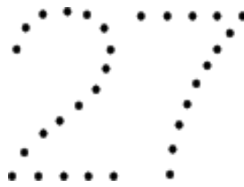
books in the New Testament