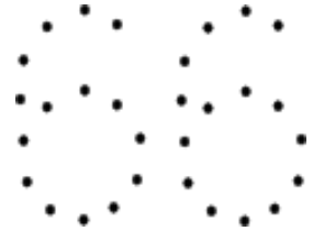
books in the whole Bible